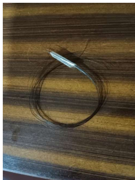
Hairs after 30 min of application Of formulation no.27