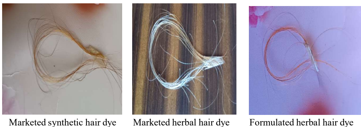
Table 8. Dye test of herbal hair dye