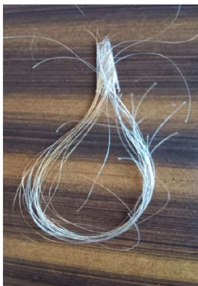
Sample white hair