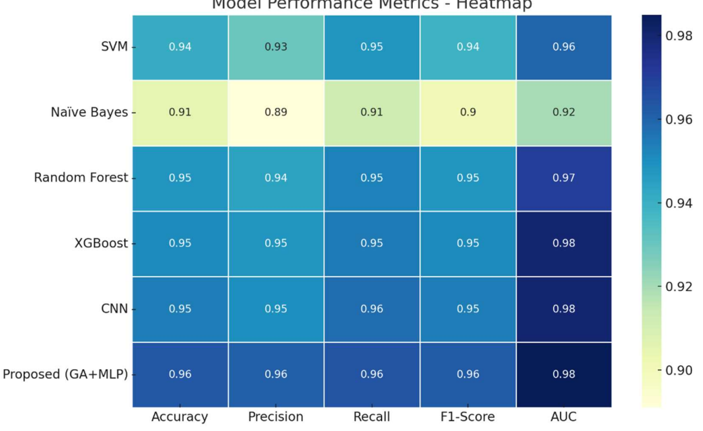
Model Performance Metrics - Heatmap

Table 2 Comparison of Classifiers on Enron Spam Dataset